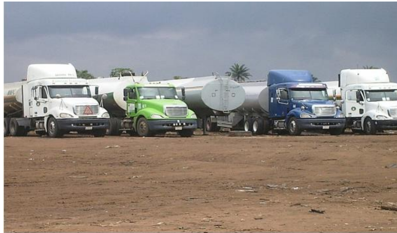
Plate 1. Typical Scene in the Environs of the Studied Haulage Park, Ogere, Nigeria

Particulate matter (PM) emissions from energy production systems have been of concern due to their impacts on human health and the environment (Fridell et al. , 2008; Ramanathan and Carmichael, 2008). The health hazards of diesel particulate matters (DPM) are well known and a concentration of about 200 \mu\text{g m}^{-3} at short exposure period of 2 hrs can lead to airway inflammatory response (Nightingale et al. , 2000; Behndig et al. , 2006). Most of the DPM consists of elemental carbon core of 0.01- 0.08 \mu\text{m} in diameter (Gan et al. , 2010). As a result of these health concerns, several authorities have set exposure standards or guidelines for DPM. In 1995, the American Conference of Governmental Industrial Hygienists (ACGIH) proposed an 8-hr Threshold Limit Value (8-hr TLV) of 0.15 \text{ mg m}^{-3} which was reduced to 0.05 \text{ mg m}^{-3} in 1998. The German occupational exposure limit set by the Bundesministerium fur Arbeit (BMA) is 0.1 \text{ mg m}^{-3} (based on elemental carbon content) while the US Mine and Safety Health Administration (MSHA) has set a target exposure limit (8-hr TLV) of 0.16 \text{ mg m}^{-3} (based on total carbon). Other sources of particulate in haulage vehicle park include dust re-suspension (Thorpe, 2007), tyre wears (Warner, 2002; Andreas et al. , 2006) and brake wears (Hulskotte, et al. , 2007) due to vehicle movements in and out of such park.