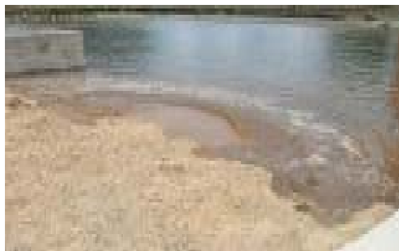
Figure 3. Waves generated during the experiment at University of Lagos Hydraulic Research Unit