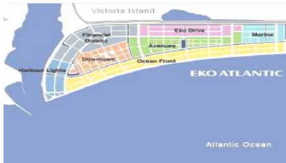
Figure 1. Layout and Districts of Eko Atlantic City