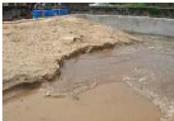
Figure 4. Rip currents eroding the model beach at University of Lagos Hydraulic Research Unit