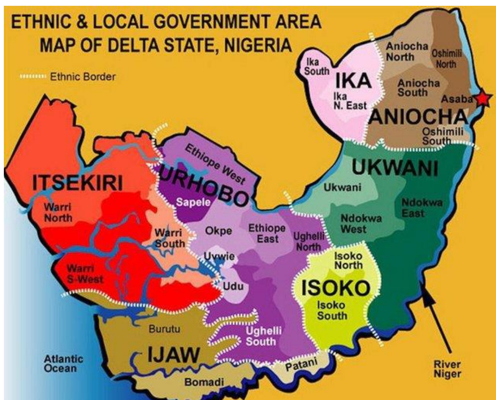
Fig 3: Map of LGAs in Delta (Adjekukor & Ighere, 2020).

projected by the state government to be 5,636,100. Delta State was one of the worst-hit states during the 2022 floods in Nigeria. A total of 21 deaths were recorded, 101611 households were rendered homeless, properties worth millions were destroyed and hectares of farmlands were washed away, with 19 out of the 25 LGAs affected in various degrees and a total of 12 IDP camps were set up with 4755 registered persons (Onabu, 2022). However, official records by United Nation’s IOM (2022) have the number of LGAs affected as seven, with 78,460 individuals in 12,070 households and 4,692 houses affected (IOM, 2022b).