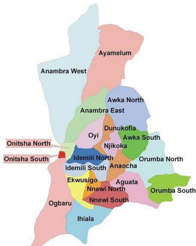
Fig 2: LGAs in Anambra (Uche, 2013)

Anambra is a Nigerian state that is located in the Southeastern region of the country created in 1976. The state has a projected population of 11.4 million residents by the Anambra State Government, making it the eighth most populous state in the country. The state has a population density of 860/km 2 and a total land area of 4,844 km 2 . Anambra was one of the states that were the worst hit by the 2022 floods in Nigeria, which led to serious ecological challenges and other consequences. According to a flood rapid needs assessment by the United Nation’s International Organisation for Migration (IOM) (2022a), Anambra state had 35074 persons in 6980 households affected by the floods in 7 local government areas (LGAs); 25,996 persons were registered at the IDP camps, 4,062 houses were affected, and 1,066 houses destroyed. On 7 October, a boat carrying people fleeing the floods in Anambra State capsized on the Niger River causing 76 deaths (The Guardian Nigeria, 2022). In total, it is believed that more than 120 persons died during the flood in the State (The Guardian Nigeria, 2022).