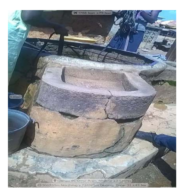
Figure 2: Resident using dug well at Igangu, Omu-Aran well site

designated as follows HW_1 – Hand dug well at Aperan, HW_2 – Hand dug well at Egbe garage, HW_3 – Hand dug well at Latinwo, HW_4 – Hand dug well at Mode, HW_5 – Hand dug well at Igangu. Prewashed polyethylene bottles were used in collecting according to the method adopted by [18]. Sample preparation was done prior to analysis using the method prescribed by [2]. Heavy metal (Fe, Mn, Cu, Zn, Pb, Al, Cr) concentrations were then determined by using bulk scientific (AAS.AA 320 N).