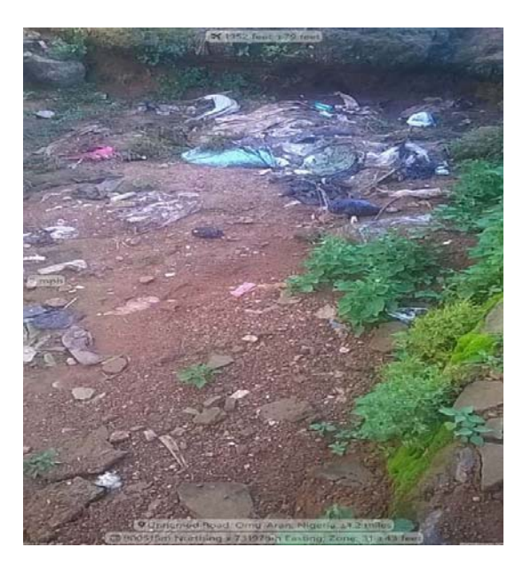
Figure 3: Point source pollution at