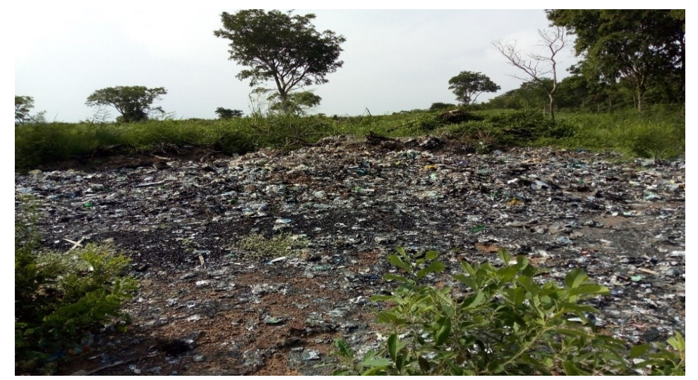
Figure 2: Open Dump in Landmark University, Omu-Aran