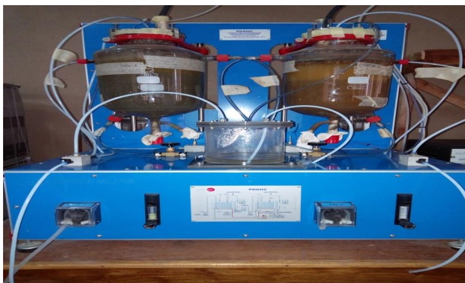
Plate.1: EDIBON Computer Controlled Anaerobic Digester, 2015 model

The feedstock is pumped from a tank into the digester by means of a peristaltic pump and a flow meter. Supernatant liquid in the digester leaves the side mouth and goes to the buffer vessel, from which the second pump that pumps to the second digester sucks. From the top of the digester, a pipe transfers the produced gas to the volumetric tank where it is measured. The digesters are heated up by means of hot water coming from a thermostatic bath passing through the jacket of the digester. Each digester has a heating water circuit with valves to be able to regulate the temperature of both digesters.