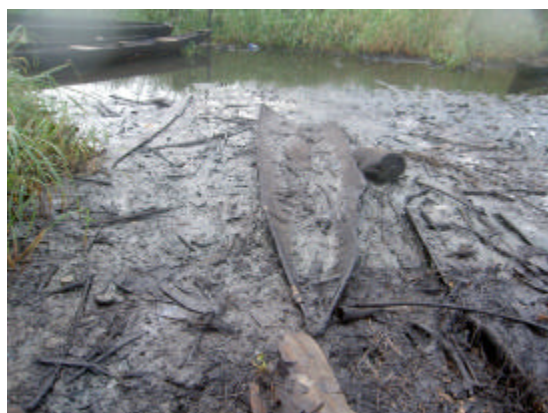
Fig. 1: The shores of the settlement's river

Chemicals and reagents: Analytical grade reagents were used. Silica gel (Kieselgel 60F 254 0-230 mesh), nitric acid (HNO 3 ), hydrochloric acid (HCl), perchloric acid (HClO 4 ) and the metal standards solutions were purchased from Sigma-Aldrich, Fluka, Switzerland. Hexane (C 6 H 14 ), sodium sulfate (Na 2 SO 4 ), dichloromethane (CH 2 Cl 2 ) and paraffine oil were purchased from Merck, Goa, India and the deionised water was purchased from the International Institute of Tropical Agriculture (IITA), Ibadan, Nigeria.