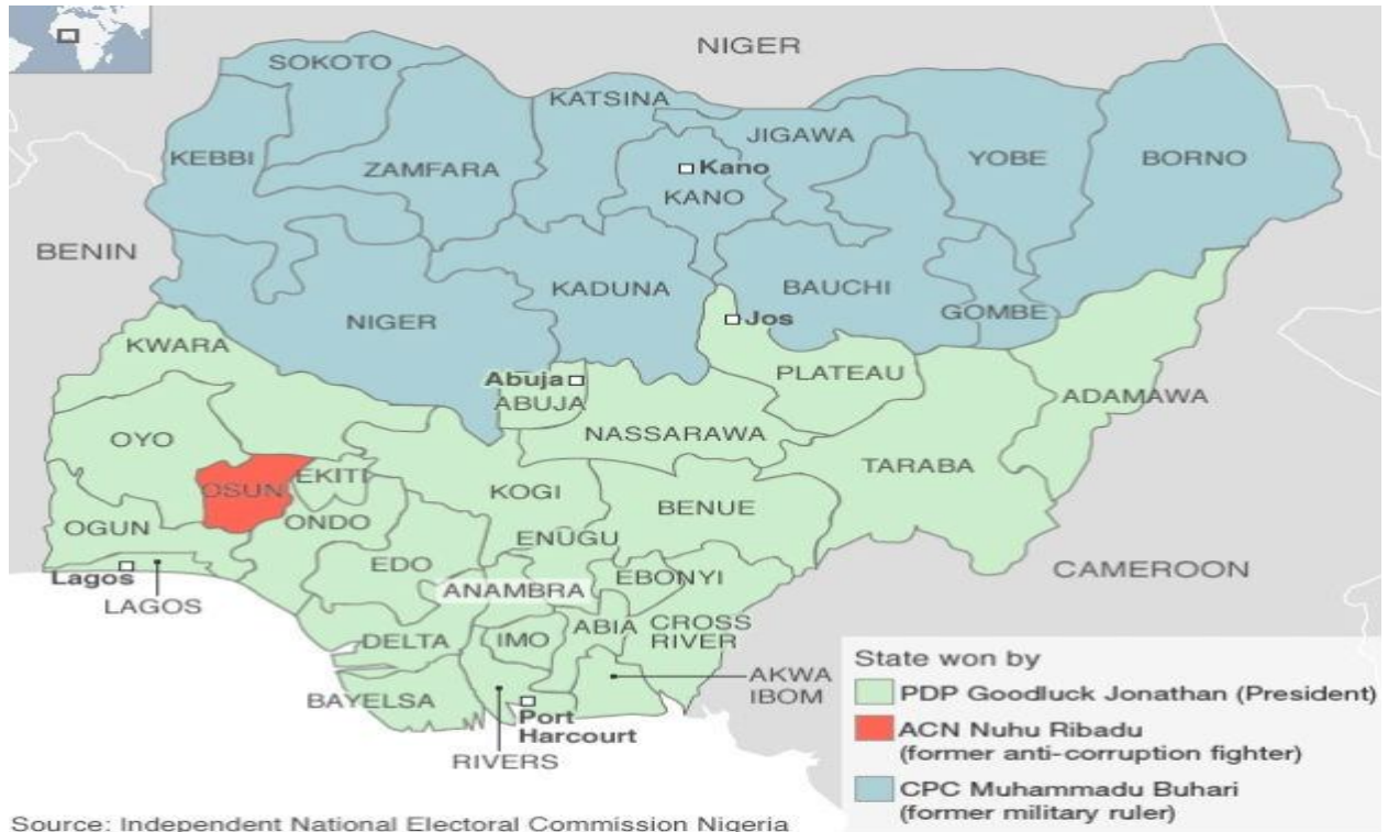
Figure 2 Map of 2011 presidential election

At the 2015 presidential poll, Jonathan (PDP) lost 8 states that it won in four years ago to Buhari (APC). The states include; Adamawa; Kwara; Kogi; Benue; Oyo; Ondo; Ogun and Lagos. Jonathan also lost in Osun as it happened in 2011. However, Ekiti was the only Southwestern state that Jonathan won in 2015. On the other hand, Buhari won massively in the 12 states he won in 2011 as the presidential candidate of CPC. The states include; Sokoto; Kebbi; Zamfara; Niger; Kaduna; Katsina; Kano; Jigawa; Bauchi; Gombe; Yobe and Borno.